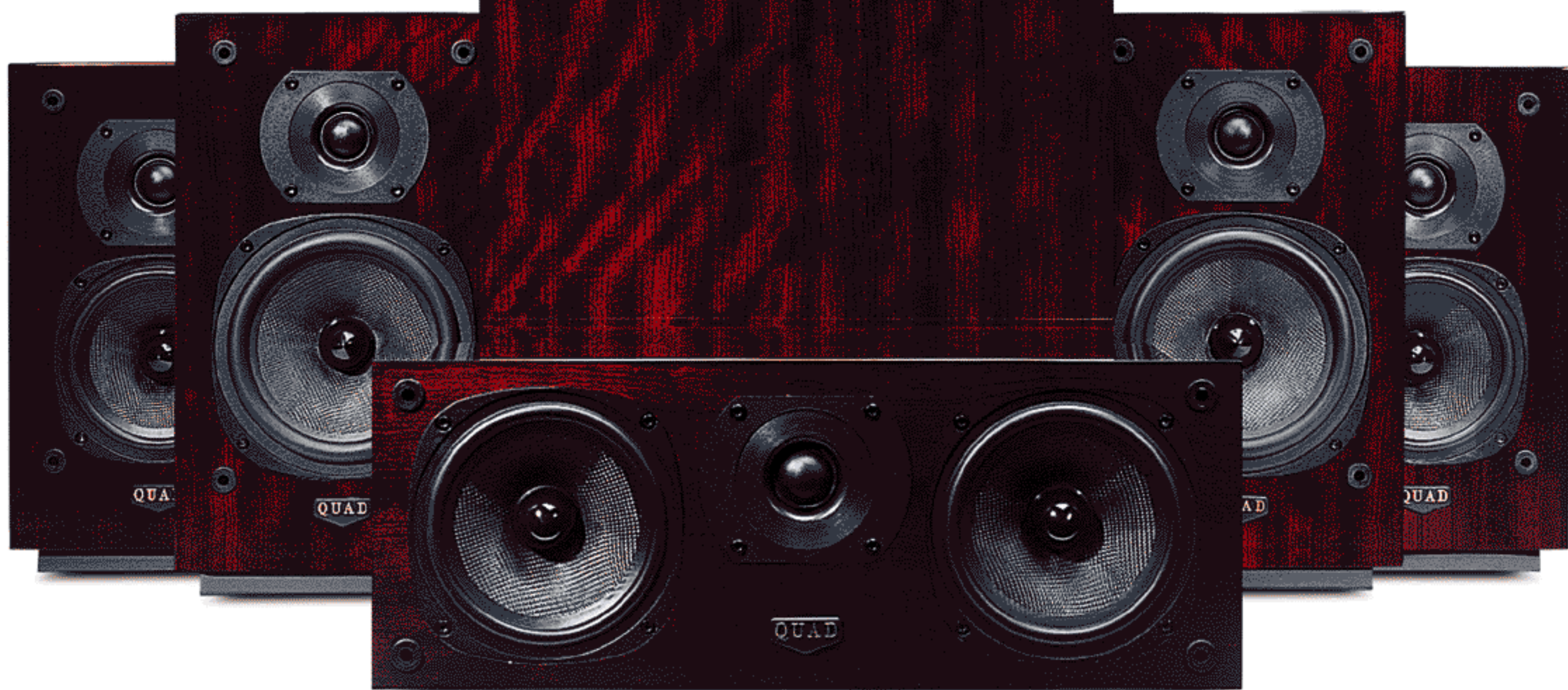
Quad's L Subwoofer, L Centre, 12Ls and 11Ls all in the same team? This is a speaker package of galacticos, but with a consistency and polish that Real Madrid would do well to copy

PLENTY OF PAGES in past issues of WHAT HI-FI? SOUND AND VISION have been filled with superlatives enthusing about the various individual components that comprise this package – so it should come as no surprise that this speaker compendium takes the podium in our full-size speaker category. After all, Quad's 12L fronts and the L Series